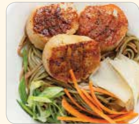
Soba w. Scallop