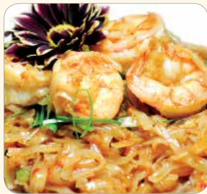
Pad Thai Noodle w. Shrimp