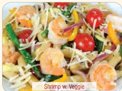
Shrimp w. Veggie