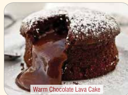
Warm Chocolate Lava Cake