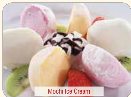
Mochi Ice Cream