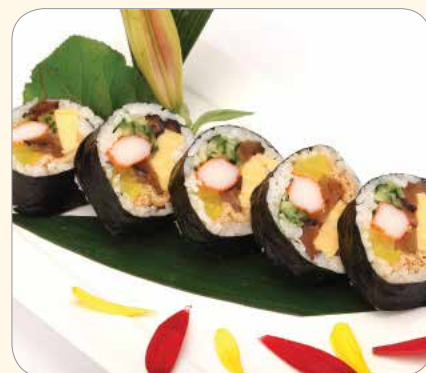
Futo Maki Roll