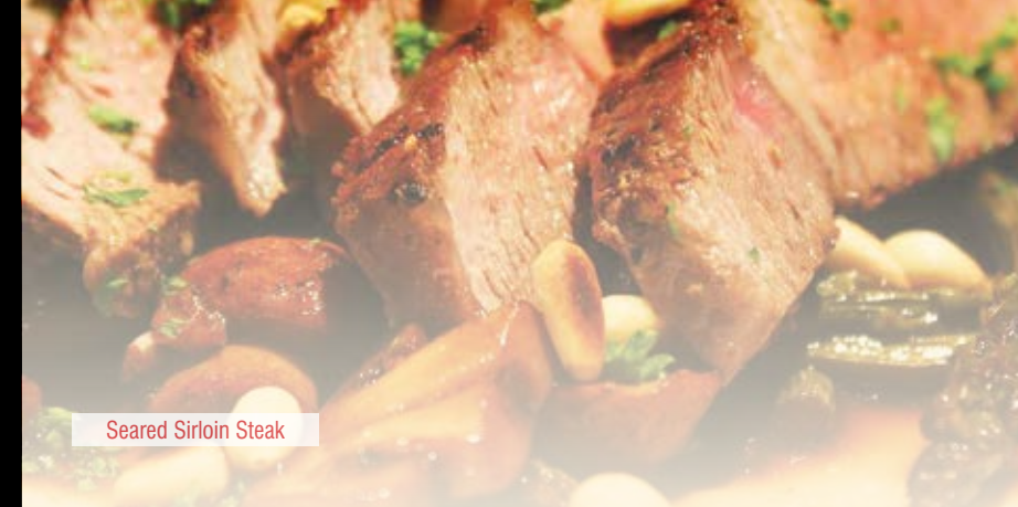
Seared Sirloin Steak